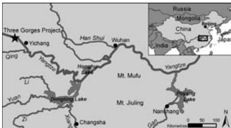
Map 6.1 China and the Yangtze River basin, including Poyang Lake and Dongting Lake

area includes the two largest freshwater lakes in China, Poyang Lake and Dongting Lake (Map 6.1) (Zhang et al., 1998; CCICED and WWF, 2004; Yang et al., 2007).