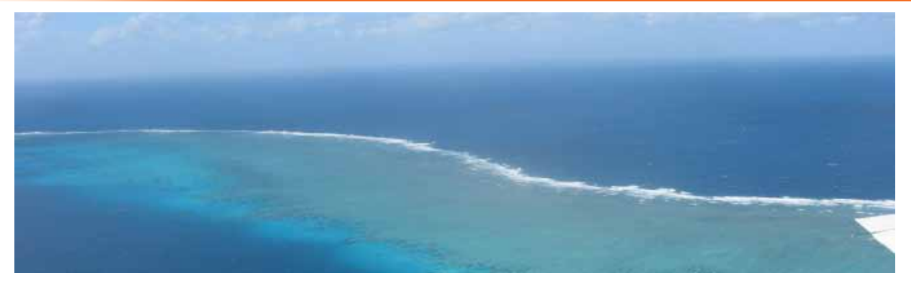
A frequent common denominator social-ecological transformations is the shift from a management of single resources to broader integrated approach with humans considered an integrated part of ecosystems. For example, coral bleaching and crown-of-thorns starfish outbreaks in Australia triggered change agents to use a national election as a political window of opportunity to implement a new zoning legislation for the Great Barrier Reef. Agency officials prepared the system at the national level by approaching national politicians to support a rezoning of the Great Barrier Reef. Source: Olsson et al. 2008.